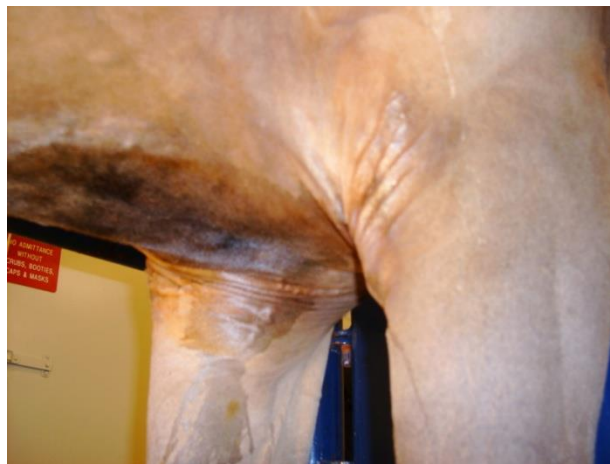
Figure 1. Clipped and aseptically prepared sternum

Step 3. Clip and aseptically prepare an area directly between the forelegs and extending at least 8-10 cm caudally and 2 cm lateral of the sternal midline. (Figure 1)